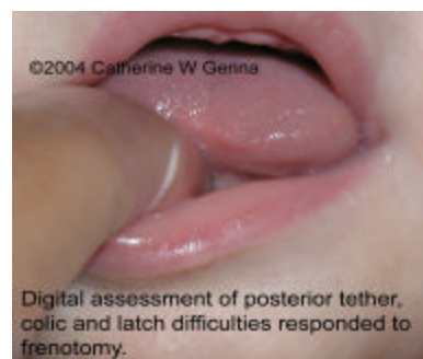
Types 3 and 4 may require a digital exam

Type 4 is most likely to cause difficulty with bolus handling and swallowing, resulting in more significant symptoms for mother and infant (see section on Diagnostic Assessment).